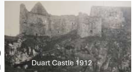
Duart Castle 1912