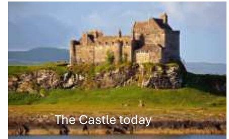
The Castle today

The MacLeans are one of the oldest Gaelic Scottish Highland clans with a history that goes back through the Loairn kindred of Dálriada noted around the 13 th Century. Throughout most of its history, the Clan MacLean was concentrated around the Isle of Mull in Argyle and the Inner Hebrides. Following the Jacobite Uprisings in the 18 th century, MacLeans spread across the globe, particularly to Americas, Australia, New Zealand, and South Africa creating the migration we know today. It is conservatively estimated that there are 308,000 MacLean families in 132 countries around the world.