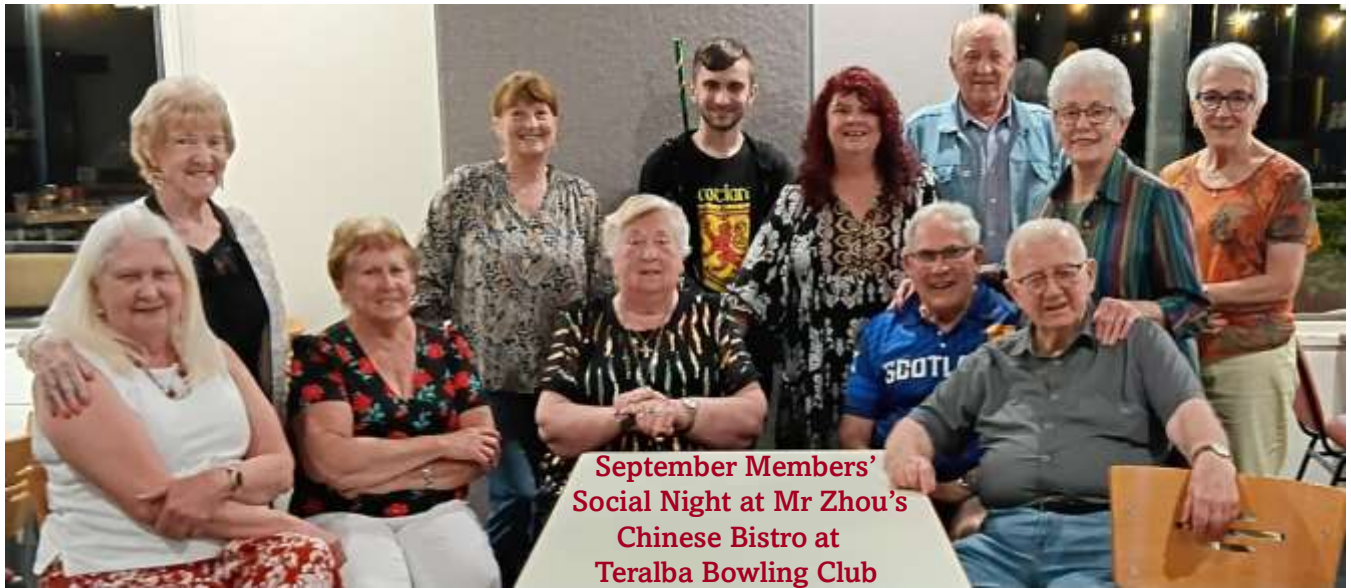
September Members' Social Night at Mr Zhou's Chinese Bistro at Teralba Bowling Club

Over the past year, we have enjoyed many months of pleasurable members' social evenings at various local venues and it has given us the opportunity of getting to know some of our newer and more senior members on a more personal level. It's always good to catch up with you for a meal and a chat and to learn the type of activities you prefer, especially our younger supporters who will be the future of the Hunter Valley Scots Club